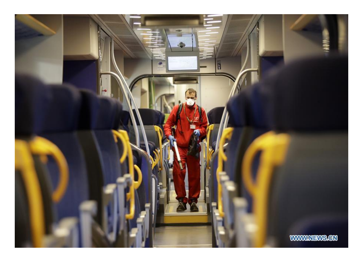
A staff member sanitizes the facilities on a train at the Garibaldi train station in Milan, Italy, Feb. 28, 2020.

that China's battle against the virus has generated favorable outcomes. But at the same time, the virus is spreading fast outside China, including Europe. Reportedly, as of 1 March, 1,520 cases and 31 deaths have been reported in Europe, including Italy (1,128 cases, 29 deaths), Germany (111 cases), and France (100 cases, 2 deaths).