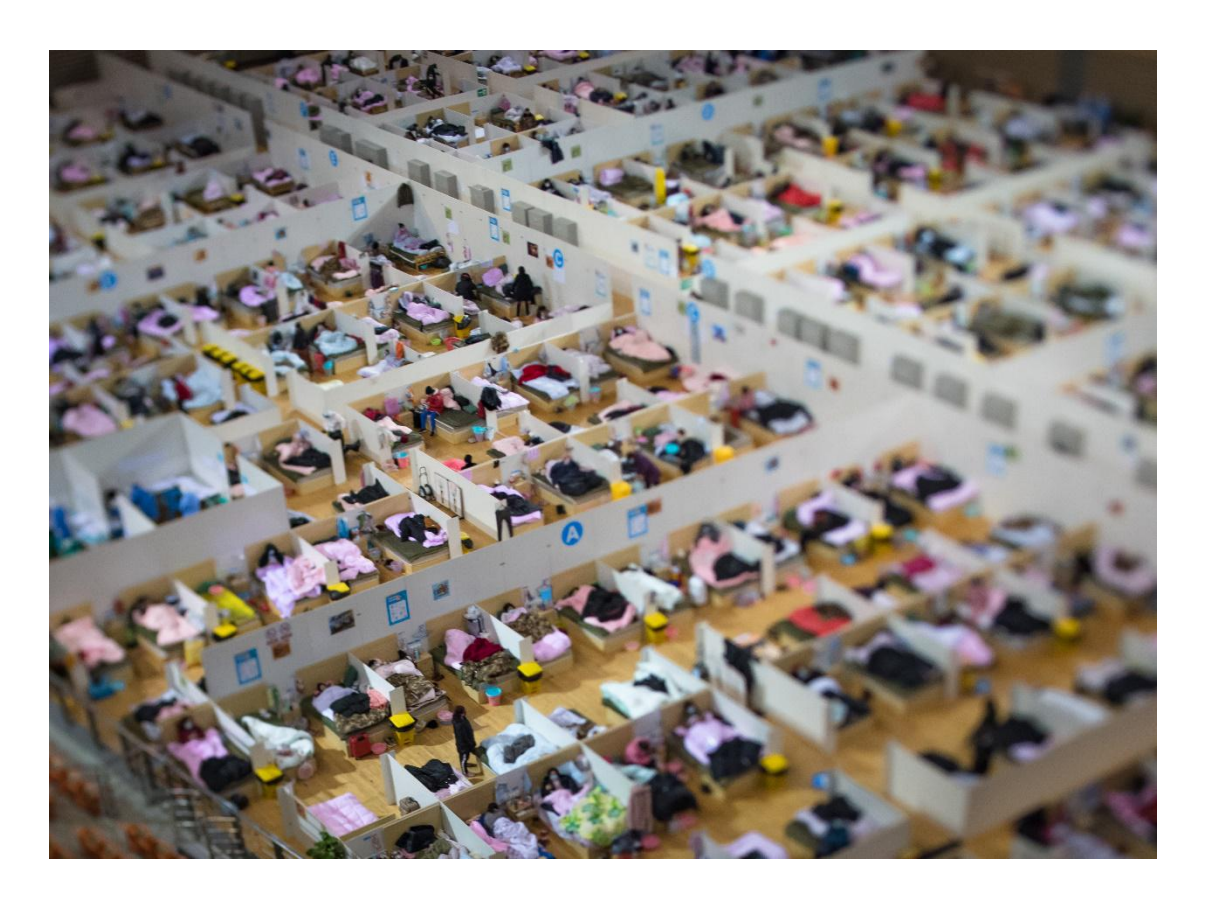
Photo taken on Feb. 17, 2020 with a tilt-shift lens shows a temporary hospital converted from Wuhan Sports Center in Wuhan, Hubei Province.

fundamental reform to build a law-based epidemic prevention and control, and national public health emergency management system<sup>1</sup>. In this case, the European know-how could be of help for China.