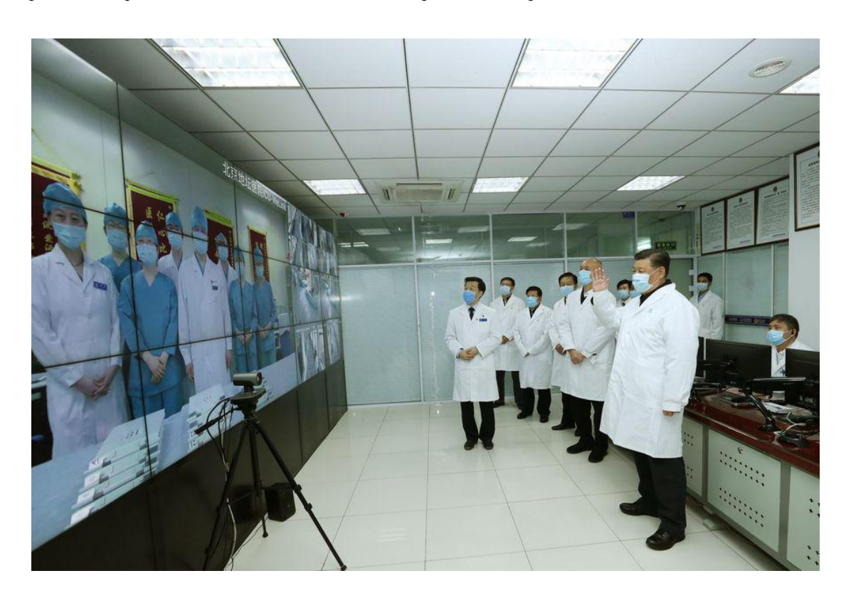
President Xi Jinping checks the treatment of hospitalized patients at the monitoring center and talks to medical staff on duty via a video link at Beijing Ditan Hospital in Beijing, on Feb. 10, 2020.

The EU has offered in-time and generous assistance to China to combat the outbreak, and they have maintained close contact on dealing with the crisis, which mirrors the sound friendship and partnership between the two actors. The article examines the health cooperation between China and the EU, as well as selected European countries, including Germany, France, United Kingdom (UK) and Italy, and analyzes the potential impact of COVID-19 to the China-Europe health cooperation.