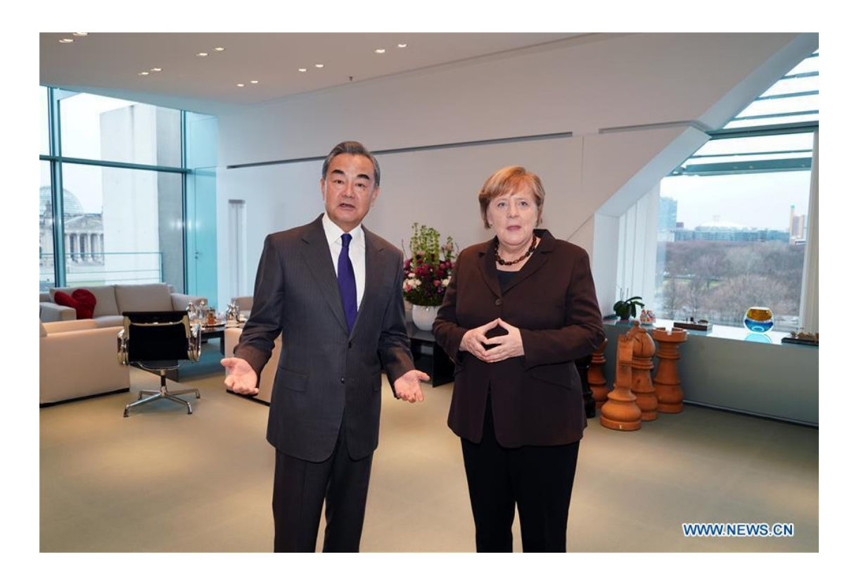
German Chancellor Angela Merkel (R) meets with visiting Chinese State Councilor and Foreign Minister Wang Yi in Berlin, Germany, Feb. 13, 2020. The COVID-19 was discussed at their meeting.

of the European Commission. In Xi's phone conversation with Macron, the two presidents expressed their strong willingness to work together to fight against COVID-19, and agreed to strengthen their health cooperation for the sake of regional and global public health security<sup>1</sup>. The Chinese and European experts also maintained close contact on the evolution of the epidemic. Two video meetings have been organized by now, attended by officials and experts from National Health Commission of China, the Chinese Center for Disease Control and Prevention, the EC's Directorate-General for Health and Food Safety and the European Center for Disease Prevention and Control. In addition, China has received official medical aid from the EC and a number of European countries, such as UK, France, as well as enterprises, civil society organizations, and private foundations.